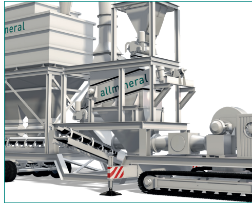
allair® | Mobile-Version

The allair® -jig was invented for dry upgrading of coal. The advantages of jigging processes are combined with the advantages of dry beneficiation processes; e.g., no need for process water, clarified water or water purification, no fines dewatering, no slurry impoundment.